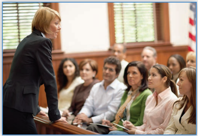
be adversely affected by a disproportionate punitive damages award.

Breaking down a company also can help humanize the defendant. The jurors might begin to see that the defendant isn't an unfeeling corporate entity but an organization made up of many individuals. Jurors may identify with innocent bystanders including shareholders and employees — who will